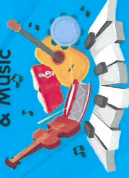
Entertainment & Music