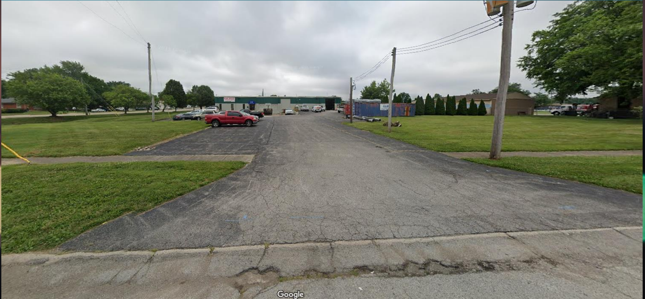
View of site from Bashford Avenue