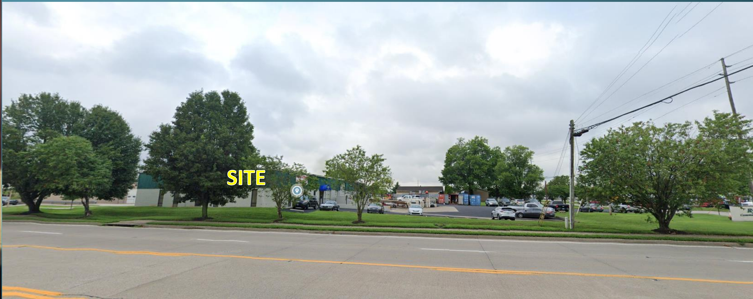
View of site from Shepherdsville Rd.