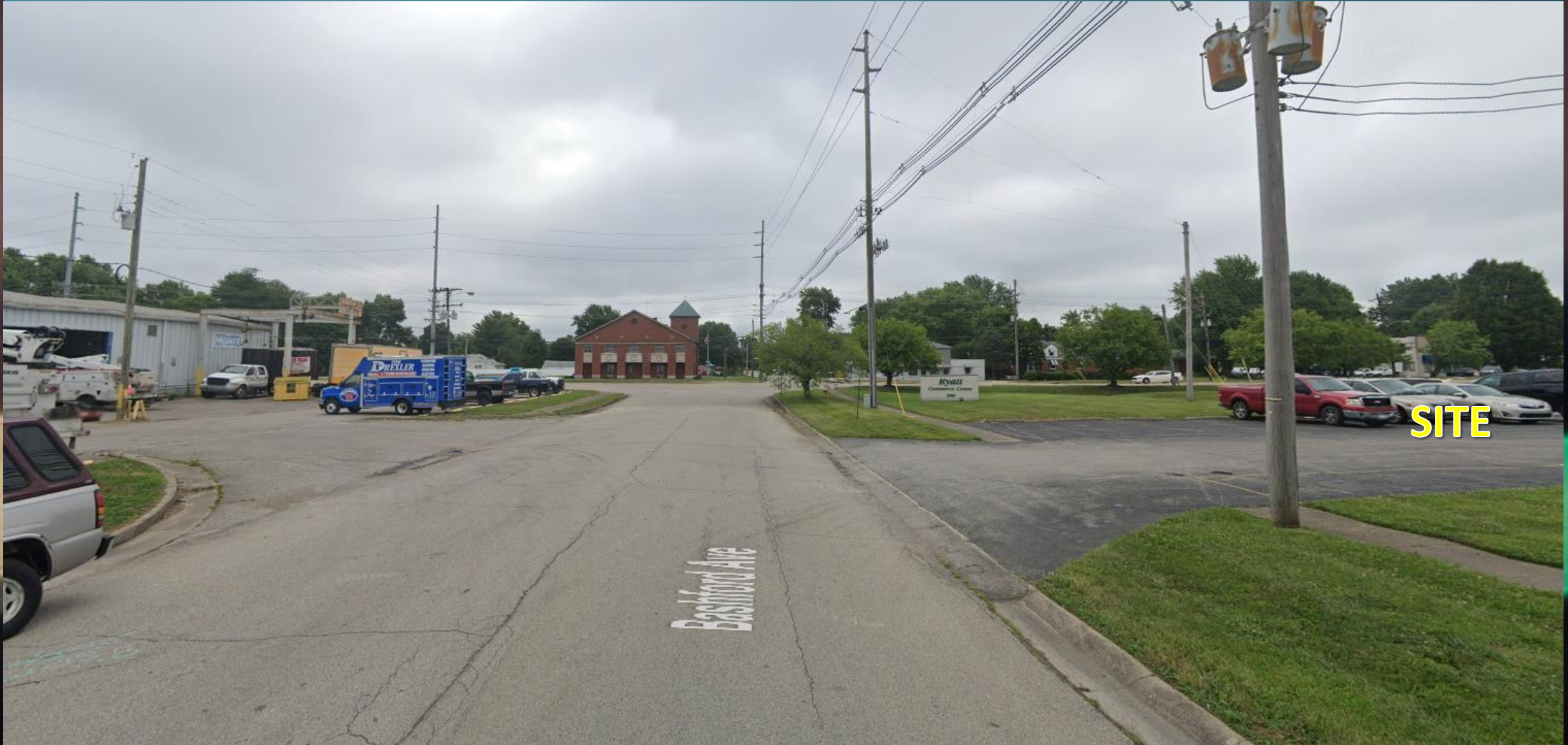
View looking east down Bashford Avenue towards Shepherdsville Rd. Site is to the right.