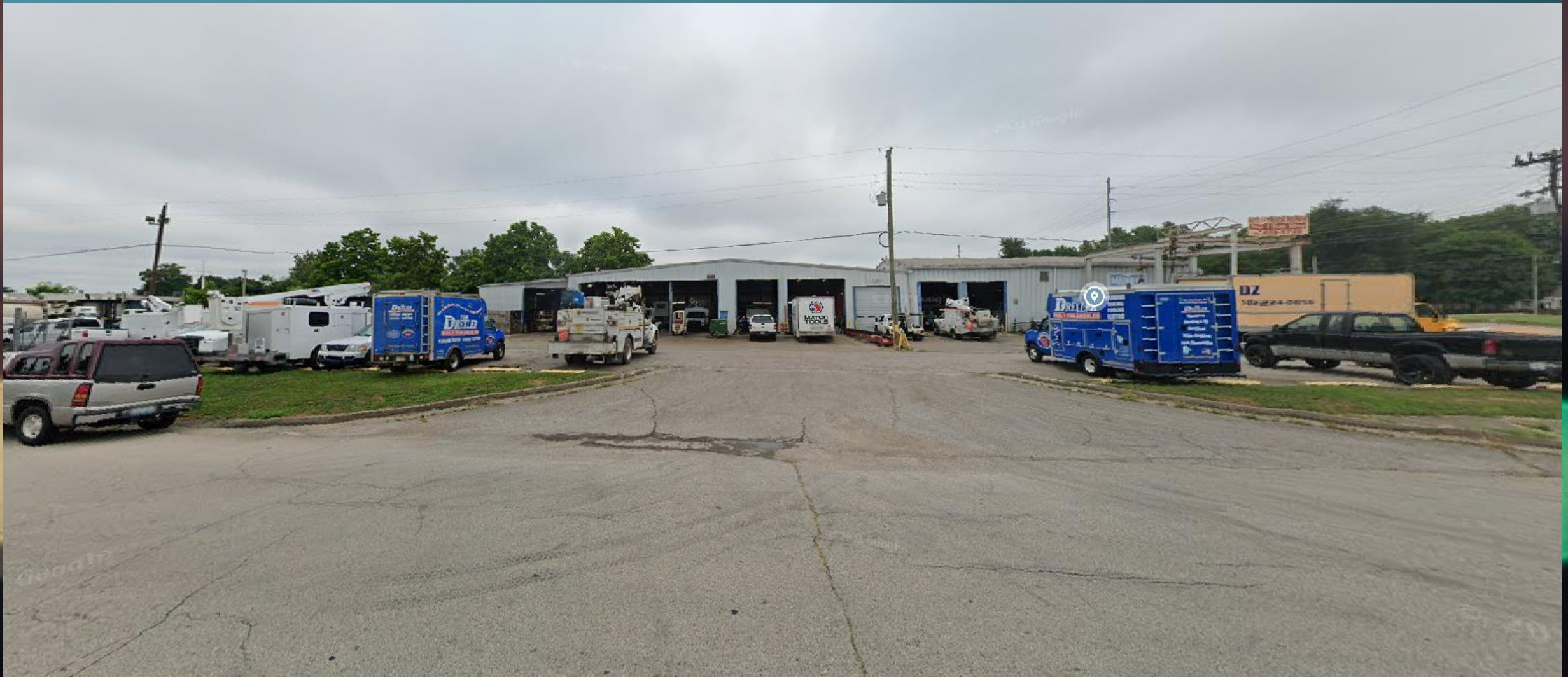
View of business across Bashford Avenue