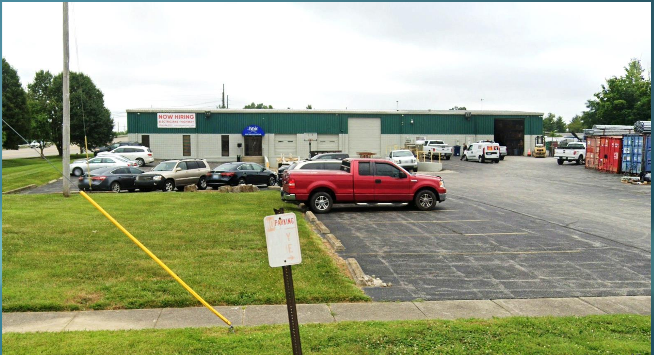
View of existing building. Proposed addition will be same style and design as existing building to mitigate requested waiver of 5.6.1.B.1.A.