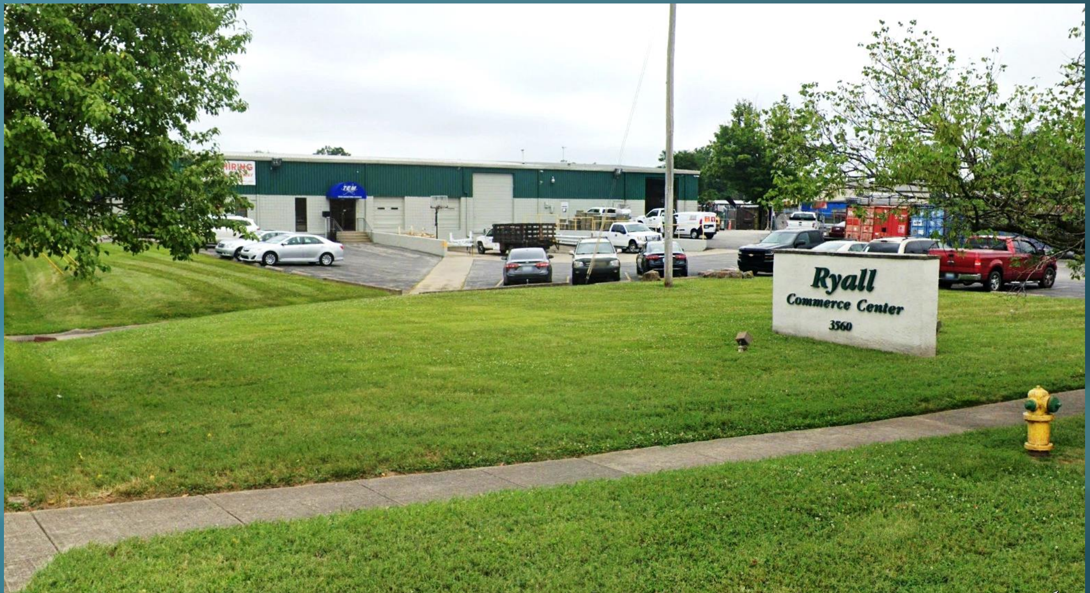
View of existing building. Proposed addition will be same style and design as existing building to mitigate requested waiver of 5.6.1.B.1.A.