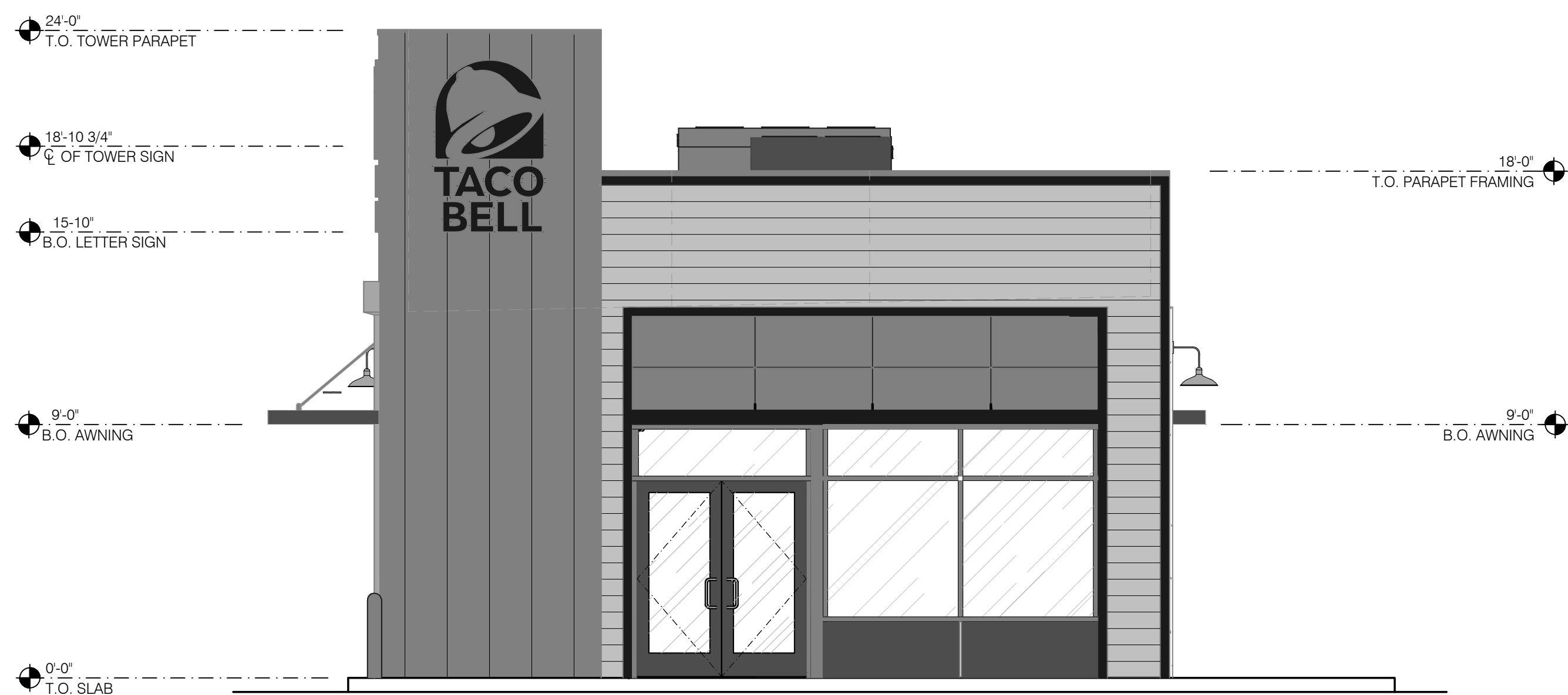
1/4'' = 1'-0''