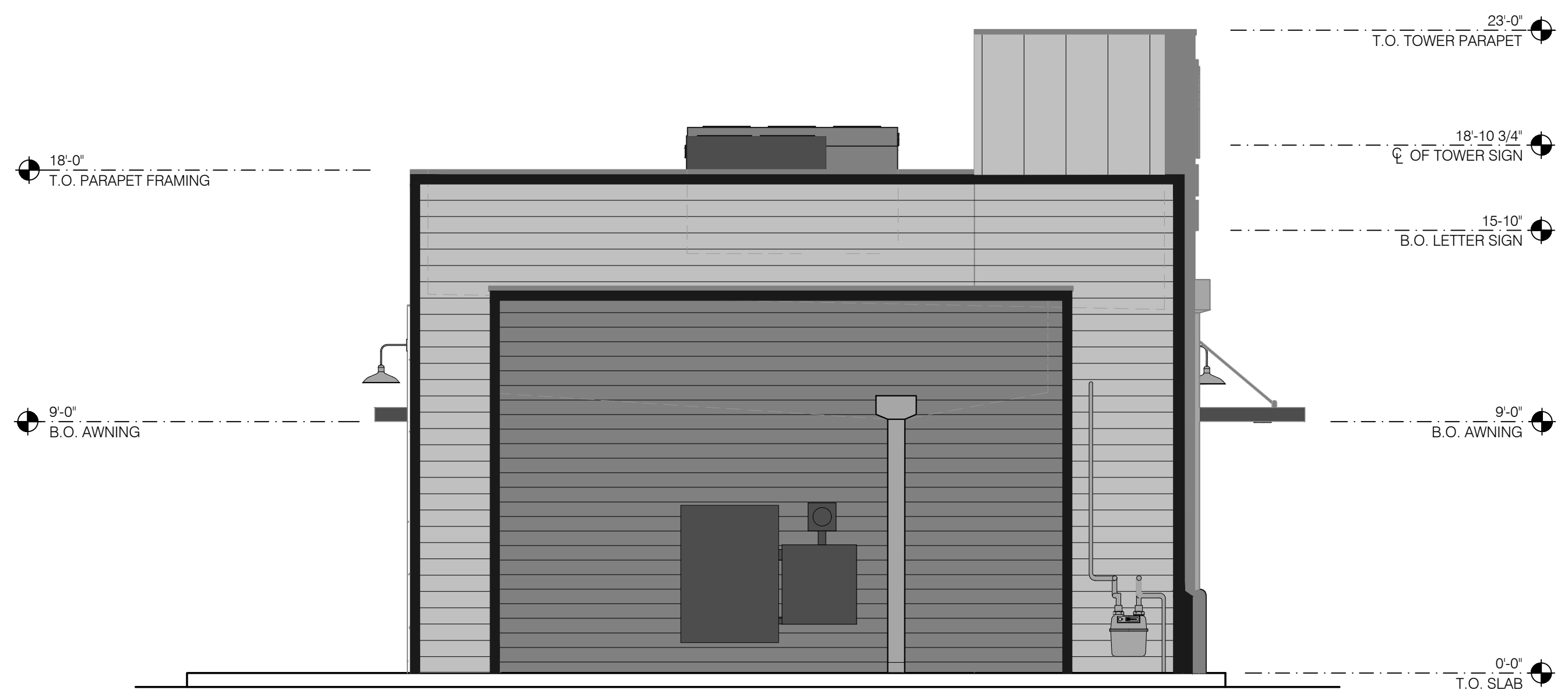
1/4^8 = 1^8 \cdot 0^8