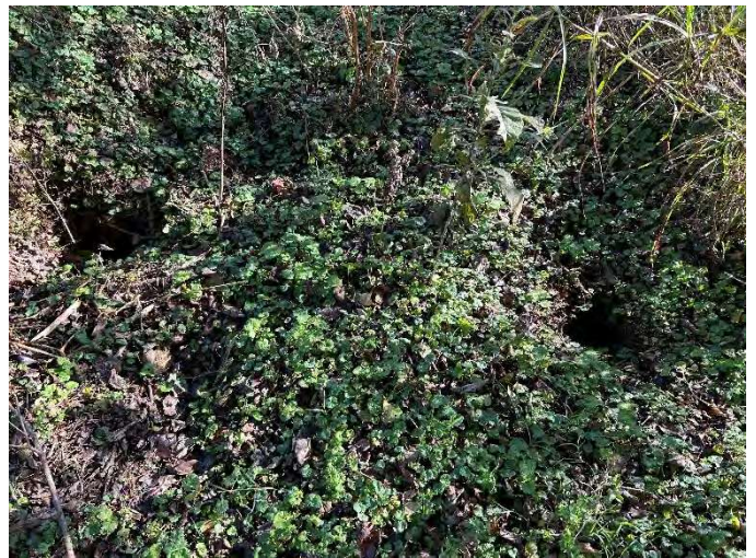
Figure 2: View of potential karst Feature 1.