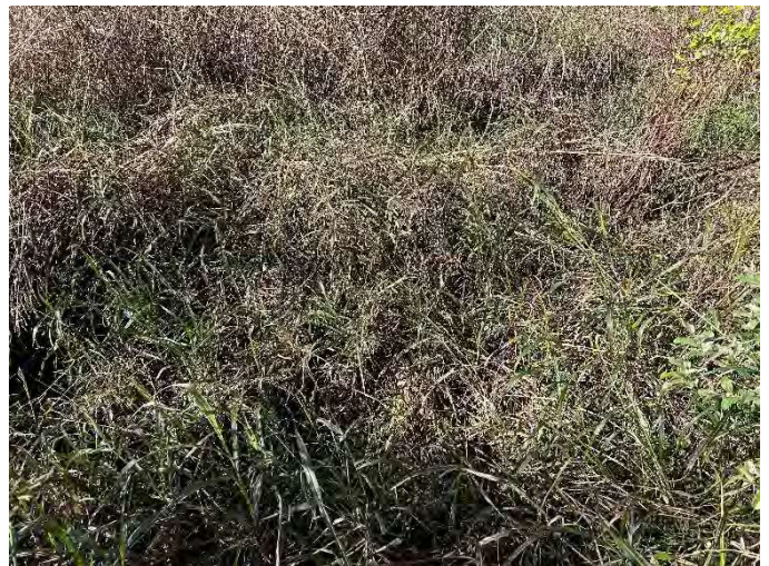
Figure 4: View of potential karst Feature 2.