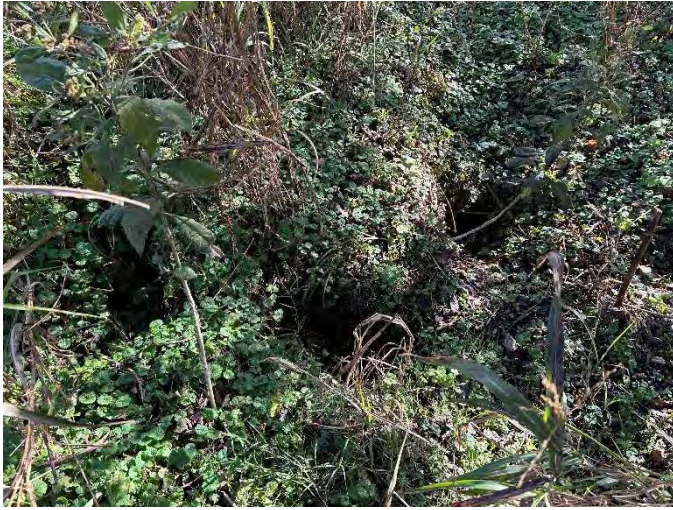
Figure 1: View of potential karst Feature 1.