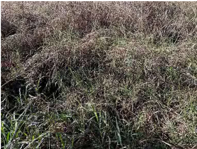
Figure 3: View of potential karst Feature 2.