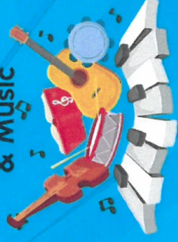
Entertainment & Music