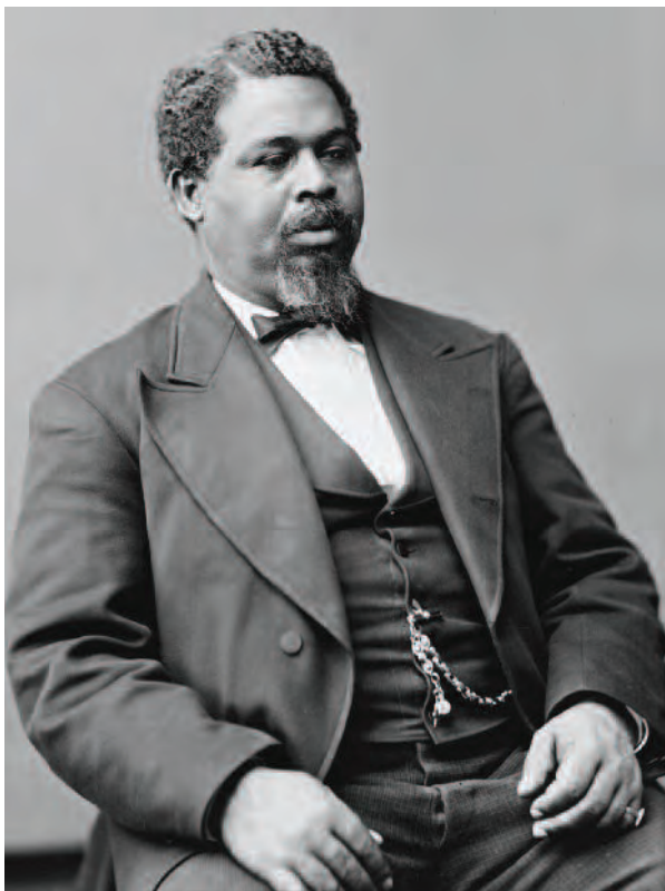
Robert Smalls, Civil War hero and Reconstruction-era Congressman.

When Senator Hiram Revels of Mississippi, the first African American elected to serve in Congress, took office on February 25, 1870, Senator Charles Sumner—a white Massachusetts