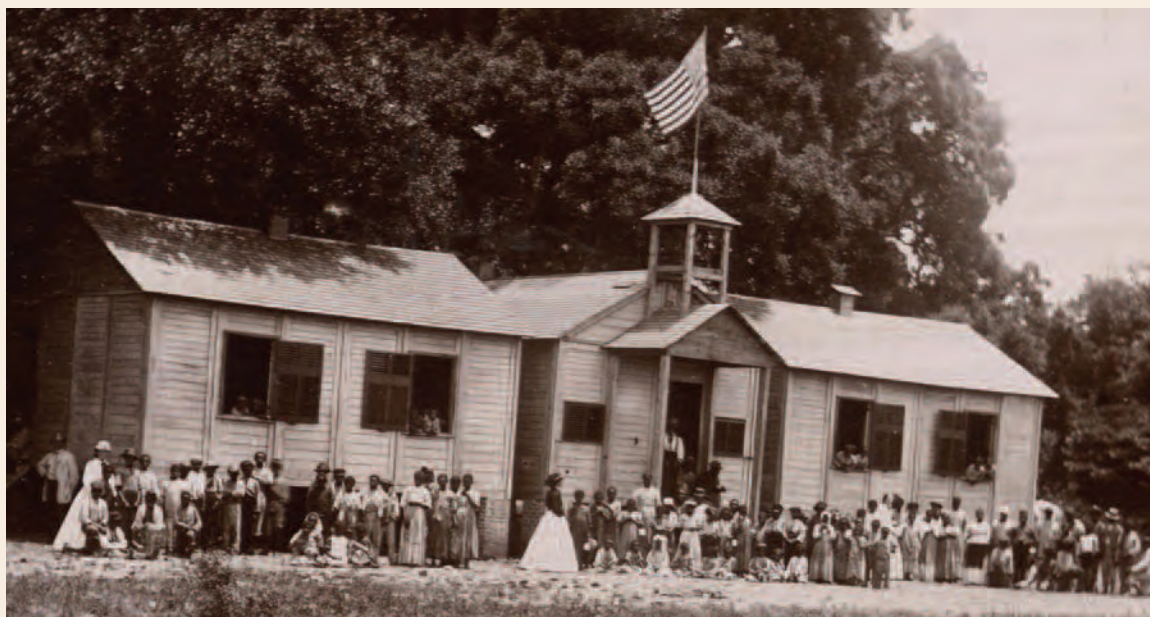
Students and teachers outside the Freedmen's Bureau school on St. Helena's Island, South Carolina, 1866.

flag to celebrate the recent presidential inauguration of former Union General Ulysses S. Grant. 138 Bureau records document many attacks on schools, including in Travis County, Texas; 139 Queen Anne's County, Maryland; 140 and Rockbridge County, Virginia. 141 In 1868, the white owner of a Clarksville, Tennessee, building that freed people wanted to use for a school declared that he would rather "burn it to the ground than rent it for a 'nigger school.'" 142