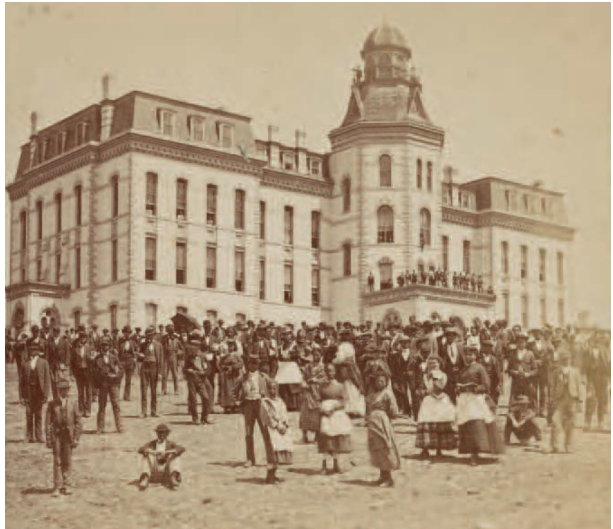
African American students on the lawn of Howard University, 1867.

Schools for African Americans were places “where the children of a once enslaved people may realize the blessing of liberty and education,” 99 Frederick Douglass stated in one of his final speeches. “Education . . . means emancipation. It means light and liberty. It means the uplifting of the soul of man into the glorious light of truth, the light only by which men can be free.” 100