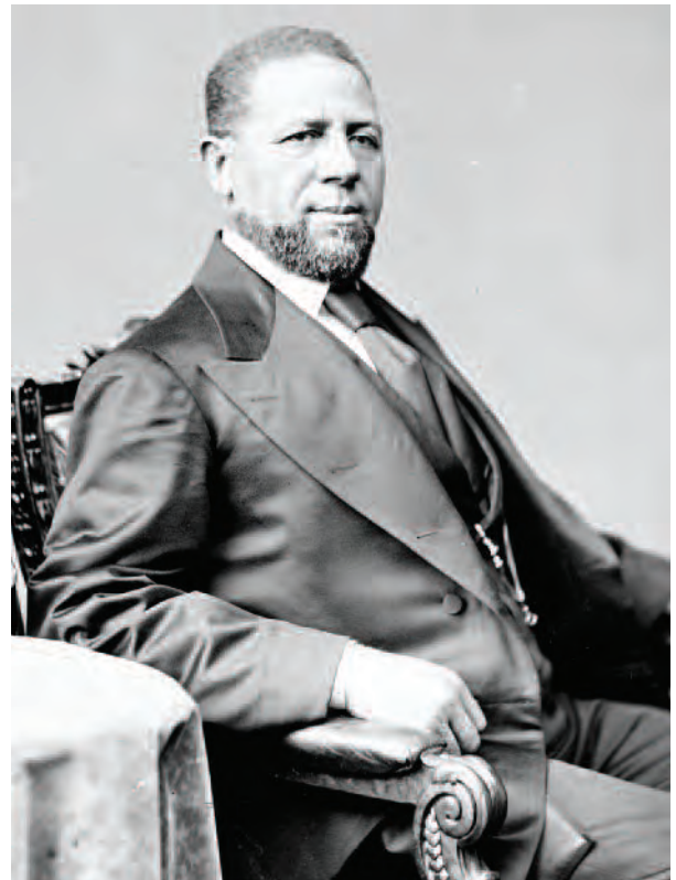
Hiram Revels, the nation's first Black senator.

The Black community mobilized after passage of the Reconstruction Amendments, organizing meetings, parades, and petitions calling for the implementation of their legal and political rights, including the right to vote. During the first two years of Reconstruction, Black people formed Equal Rights Leagues throughout the South. These groups held state and local conventions protesting discriminatory treatment and demanding the right to vote and equality before the law. 82