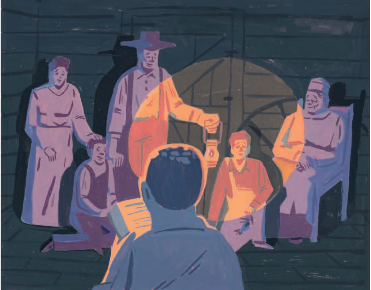
In freedom, Black men, women, and children worked together to gain knowledge and share it with one another. (Illustration by Jamiel Law)

Despite these overwhelming obstacles, some African Americans did manage to acquire land, build businesses, and achieve social mobility during Reconstruction. In a few cases, Black people in the South obtained assistance from the Freedmen's Bureau and combined personal resources to buy shared farms or small plots of land. 117 Shortly after the war's end, some Black people—particularly those in or near larger cities—also began to open small businesses and establish themselves as blacksmiths, barbers, shoemakers, builders, and grocers. 118