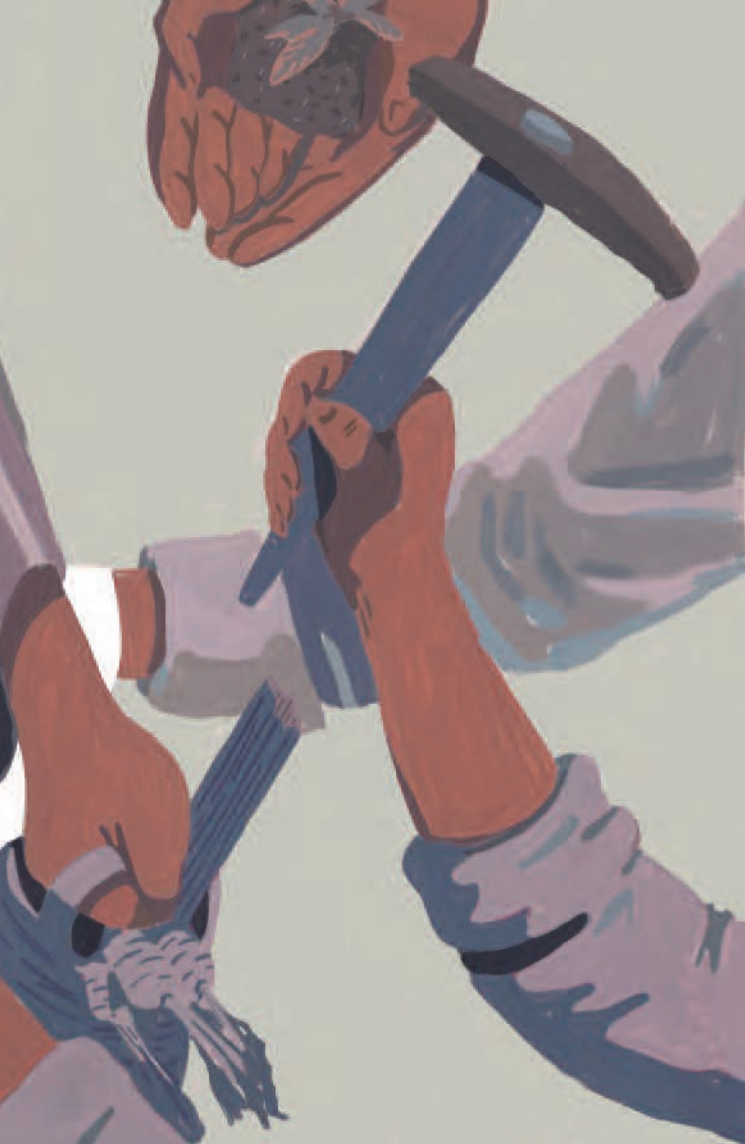
Emancipated Black Americans sought education and work to realize the promise of freedom.