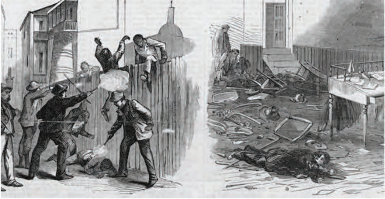
The 1866 New Orleans Massacre.

On July 30, 1866, at what is today the Roosevelt Hotel, New Orleans was hosting a convention of white men working to make sure Louisiana's new constitution would guarantee Black voting rights. In the weeks leading up to the convention, local press denounced the attendees as traitors and invaders. "Within a short time," warned the Louisiana Democrat , "we may expect to see the State of Louisiana a member of the Union, with nigger suffrage, nigger Senators, and nigger representatives." 59