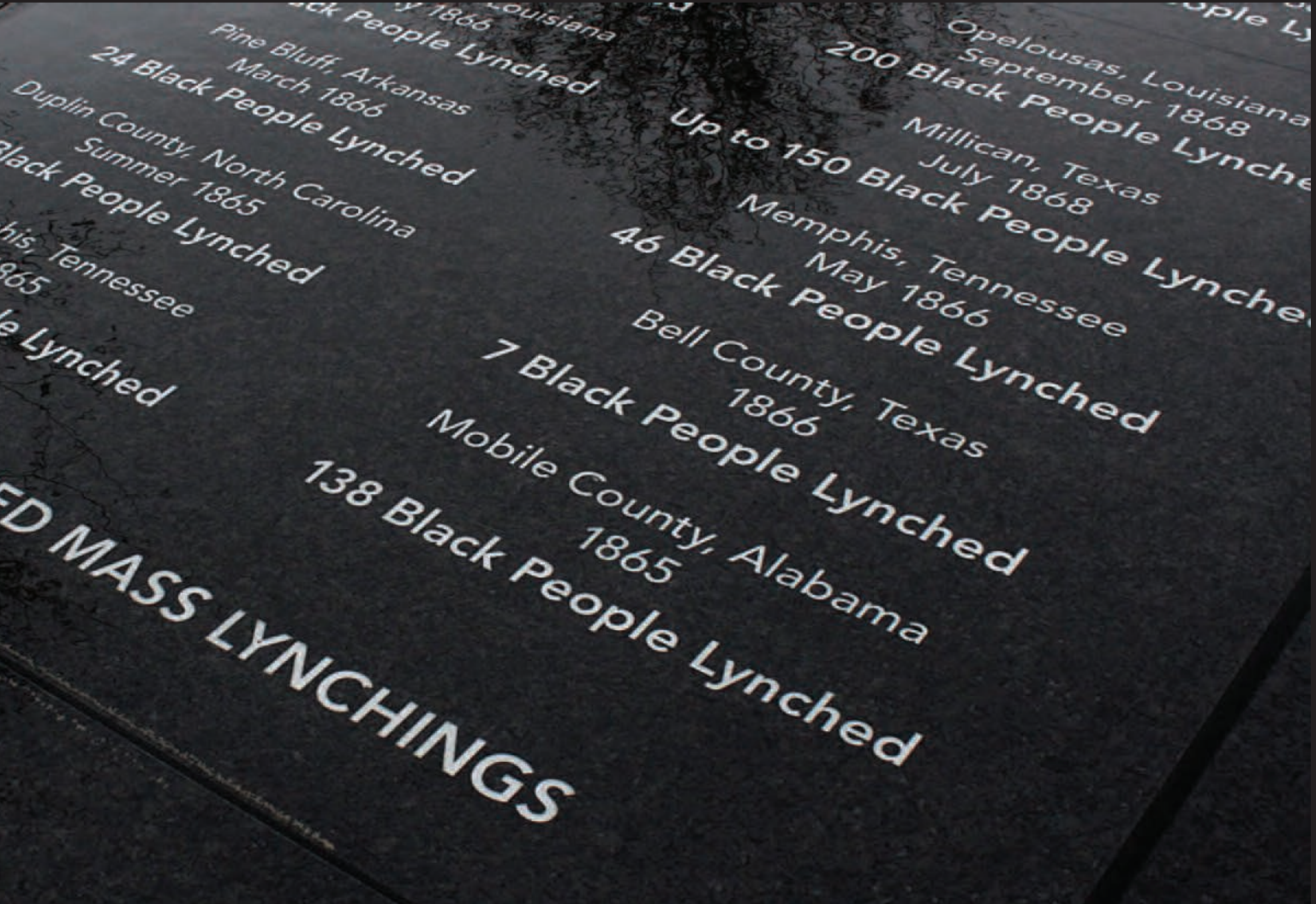
The Memorial at the EJI Legacy Pavilion features the locations and estimated death tolls of 34 Reconstruction-era massacres that targeted Black communities. (Jose Vazquez)