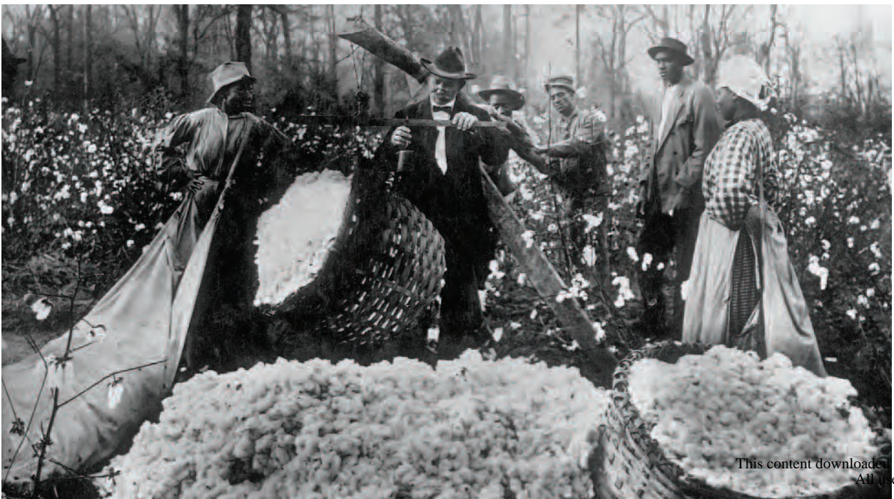
A white manager weighs cotton picked by African American sharecroppers circa 1870.

Many Black farmers had to take high-interest loans as their only means of purchasing exorbitantly-priced necessities, deepening the debt trap. When they tried to enforce contracts at the end of the season or negotiate better ones, they were met with violence from landowners or organized “regulators” who used terror to force agreement. 116