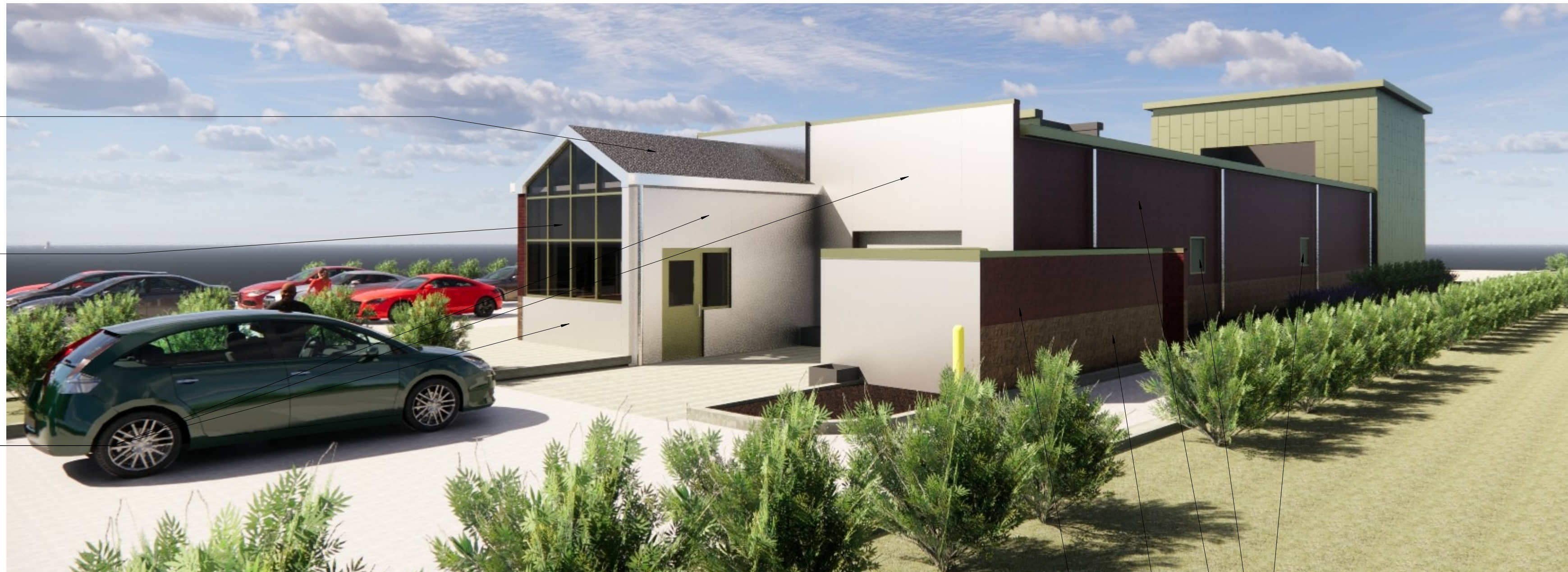
Scheme 1 - Rendering From South East