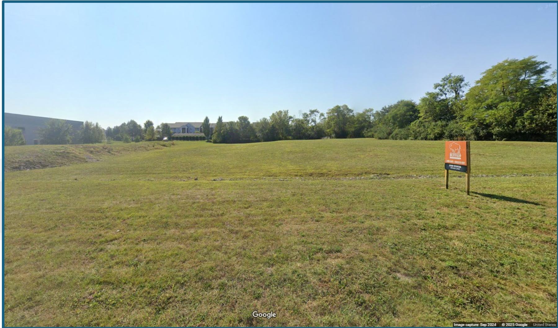
Front from Otto Knop Drive