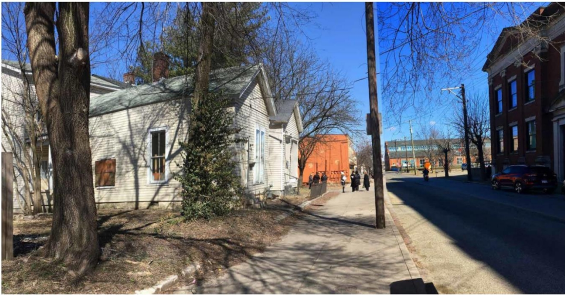
18 th Street Today