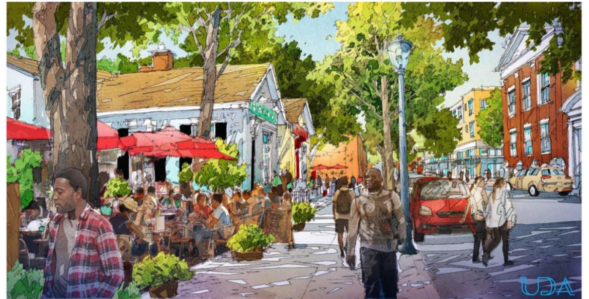
18 th Street Tomorrow