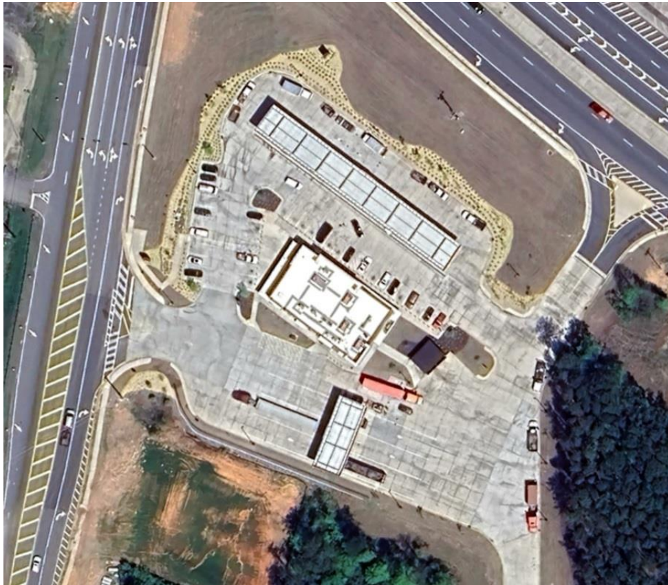
FIGURE 1 4337 Cobb Pkwy NW, Acworth GA 33 Parking Spaces 6,008 SF