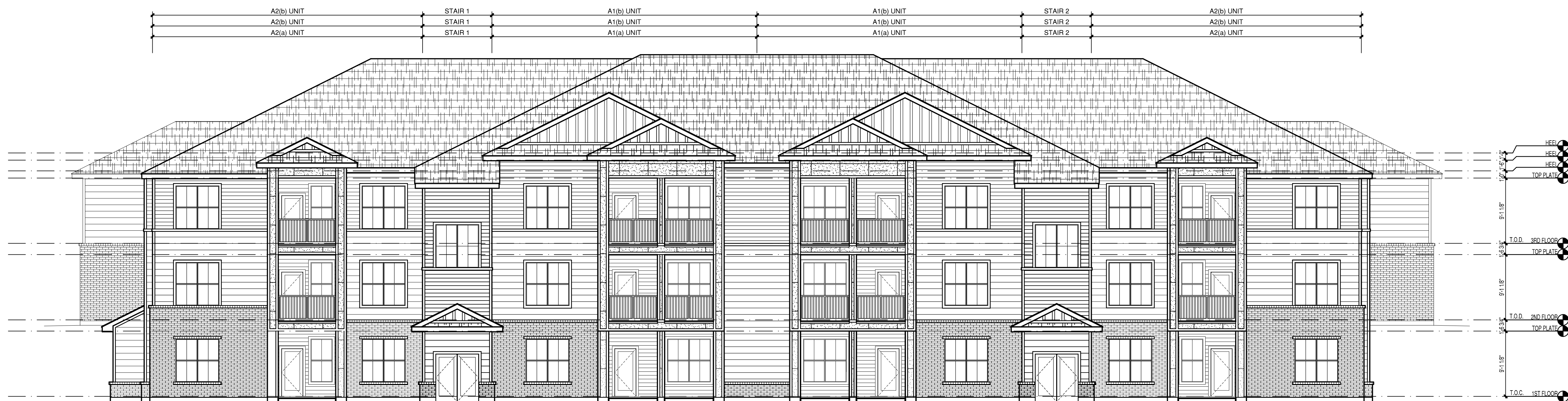
4 BUILDING A-ALT BACK ELEVATION SCALE 1/8"=1'-0"