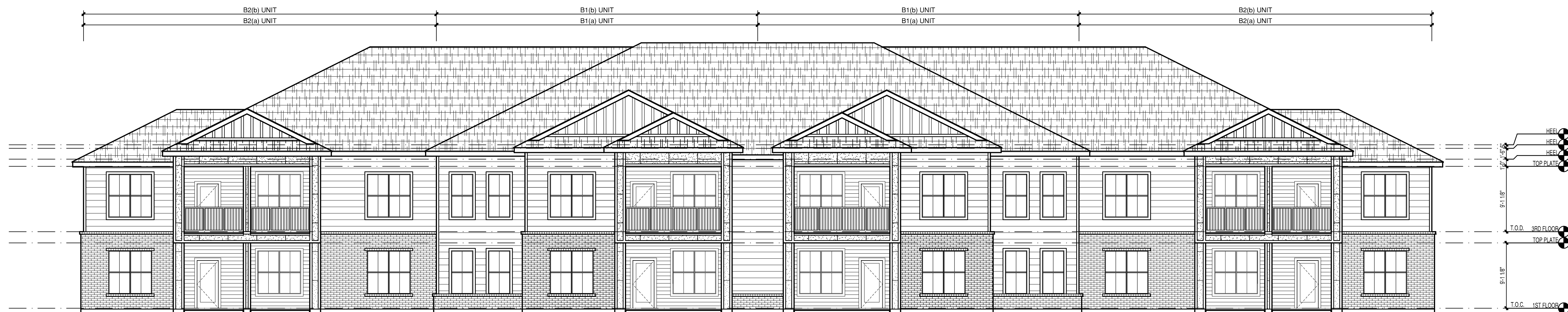
2 BUILDING A-ALT FRONT AND STREET SIDE ELEVATION (CEDAR CREEK ROAD FACING ELEVATION) SCALE 1/8"=1'-0"